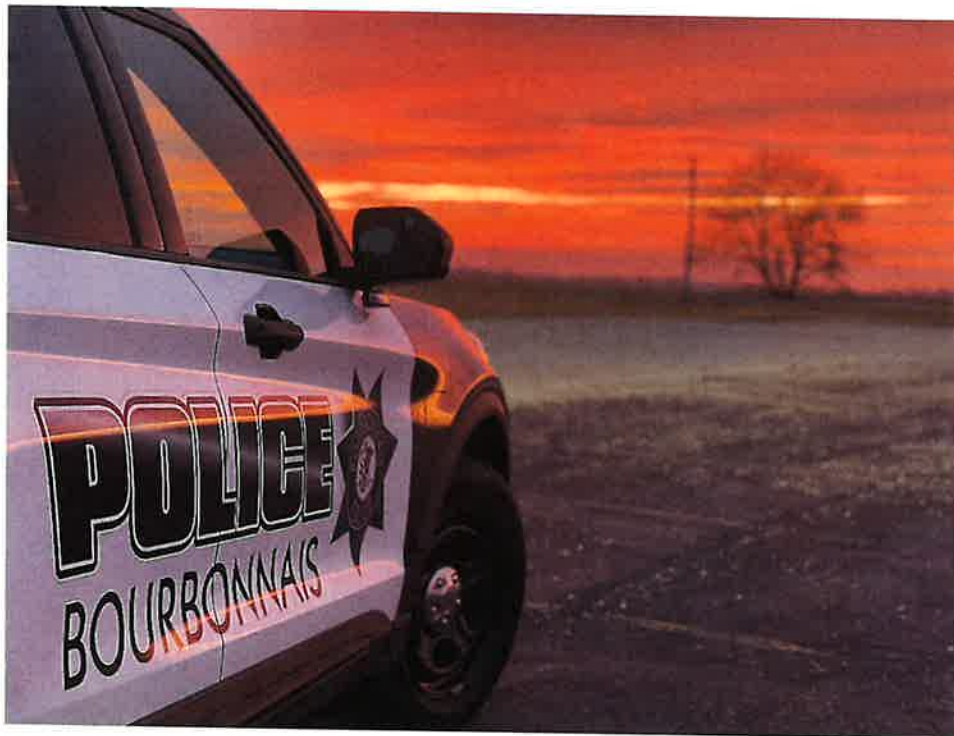
The wonderful views our officers get to see in the Village while on patrol.