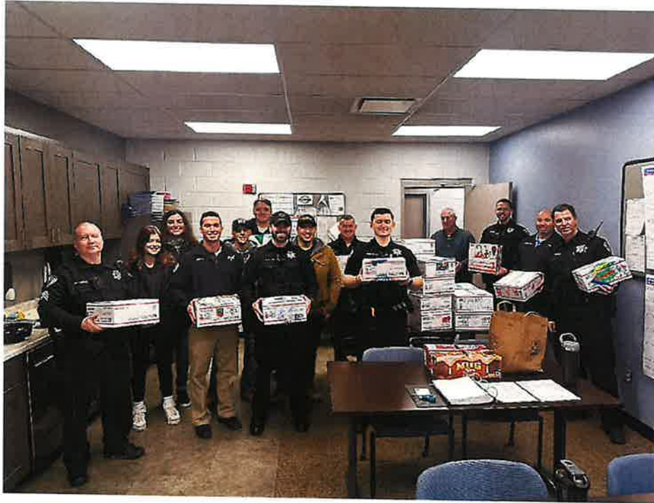
Project Headspace and Timing donates care packages to our officers.