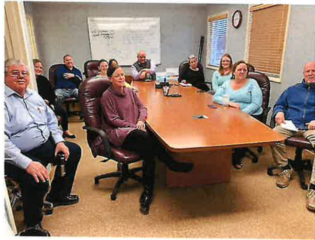
Pt. M. Czako doing Safety training for the Village Administration building. Helping keep our employees safe and informed.